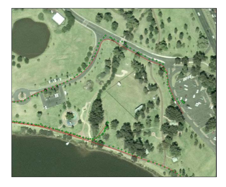
Figure 6. Start and end of the course (Click for larger image).

The red line (aerial photogrammetry) shows how easy it is to maintain the shortest possible route around corners but the green dots show that DGPS fails to maintain the correct route. Note: the route makes one lap of the river before coming back onto itself to finish near the start, hence the two red lines along the same path.