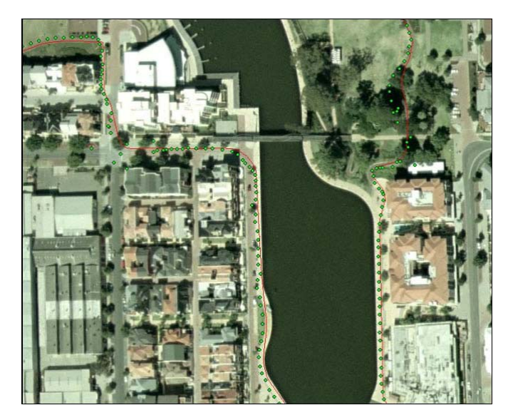
Figure 5 (below) is an example showing how DGPS obtained the correct route under the canopy of trees (top right of the figure) but aerial photogrammetry failed to get the correct route. The DGPS and photogrammetry show good agreement for most of this area, due largely to the relative clear sky visibility. There is some scatter near the two-storey buildings at the top-left of the figure.