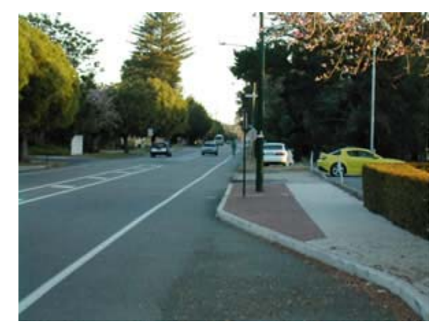
Figure 1. Looking south down the 1km baseline (Click for larger image)

The baseline was originally set out by a surveyor. However, prior to commencing these JO counter measurements, the west and eastern baselines were measured using a pre-calibrated total station (i.e. EDM). The total station is rated at +/- 4mm over this distance. The distance measurement was also corrected for systematic effects of temperature and pressure. Each baseline was determined to be 1000m.