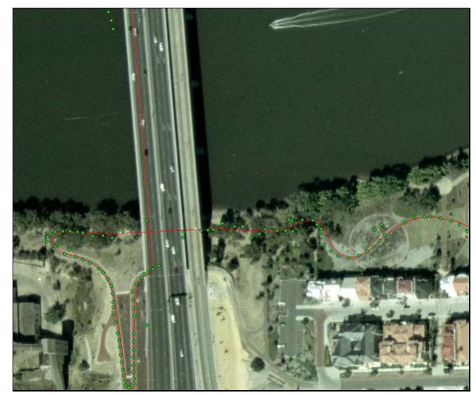
Figure 4. Loss of observations due to loss of sky visibility (Click for larger image).

Figure 5 (below) is an example showing how DGPS obtained the correct route under the canopy of trees (top right of the figure) but aerial photogrammetry failed to get the correct route. The DGPS and photogrammetry show good agreement for most of this area, due largely to the relative clear sky visibility. There is some scatter near the two-storey buildings at the top-left of the figure.