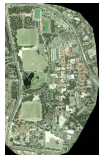
Figure 2. Aerial photograph of Curtin campus (Click for larger image).

This experiment was to assess the precision of the JO counter on a route that was undulating and involved curves. The route was not a race course but a 2.9km circuit within the <u>Curtin University</u> campus (<u>on-line map here</u>). The advantage of this circuit is that no vehicles are allowed to park anywhere along the route. Furthermore, the traffic was always very light and posed no hindrance to the cyclists.